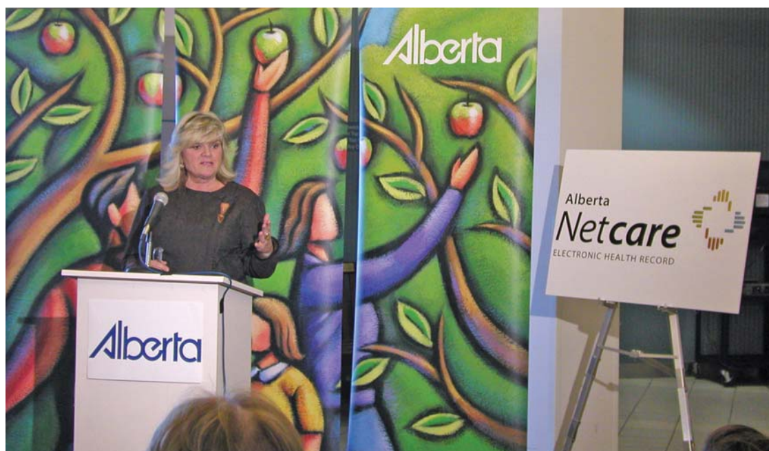
IRIS EVANS, MINISTER OF HEALTH AND WELLNESS, ANNOUNCES ADDITIONAL FUNDING FOR ALBERTA NETCARE ELECTRONIC HEALTH RECORD

This new funding will support the health regions in acquiring new hardware for provincial systems and software to update systems such as inpatient and ambulatory care health information systems.