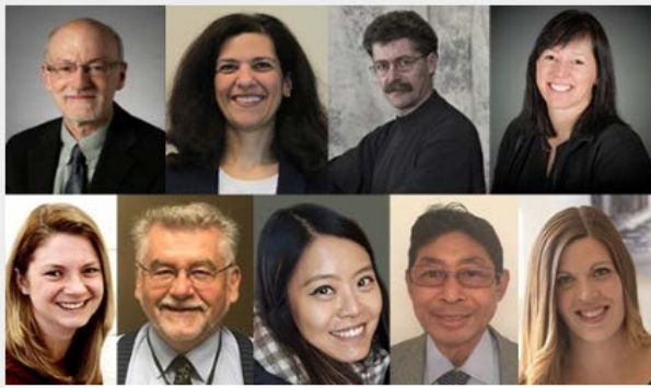
Bottom: QuRE working group